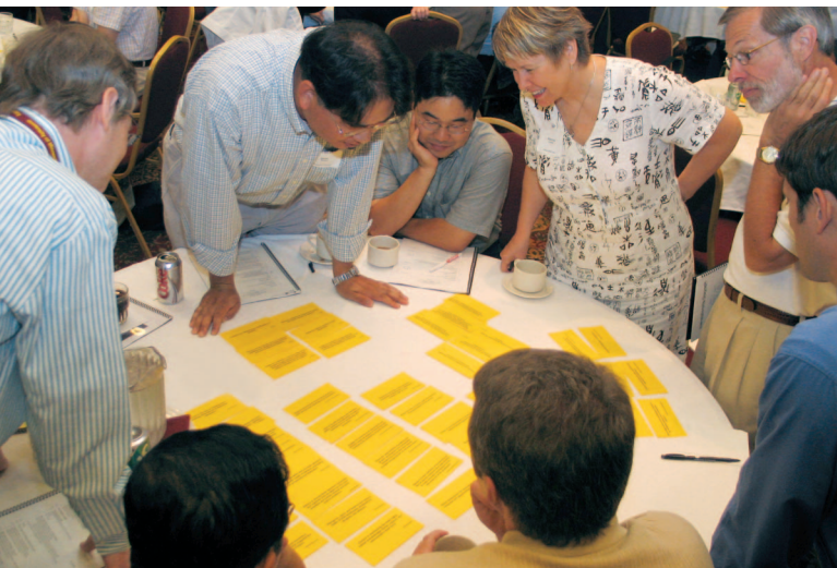
Setting the standard. The School of Dentistry's first strategic planning initiative in nearly a decade included multiple opportunities for more than 300 staff, students, faculty, and friends of the school to help plan, meet for progress reports, and provide feedback.